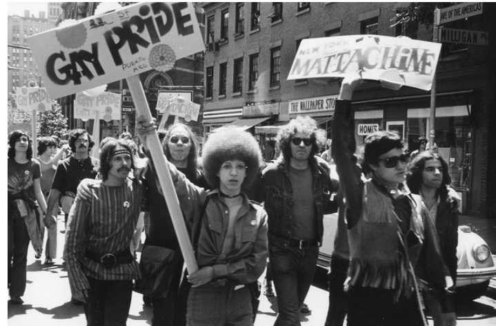
Demonstration by the Mattachine Society, the first Gay Rights organization in the United States.