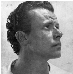
Harry Hay Gay Rights activist, labor organizer, and co-founder of first gay rights organization in the USA, The Mattachine Society .