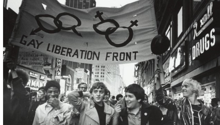
Demonstration by the Gay Liberation Front, a group that formed quickly after the Stonewall Riot.