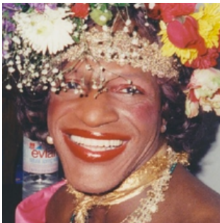
Marsha P. Johnson Organizer with Street Transvestite Action Revolutionaries (STAR), a group that organized around drag queens of color and homeless LGBT+ people.