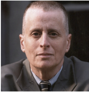
Leslie Feinberg Butch Lesbian, transgender activist and author of works such as Lavender and Red , Transgender Warriors and Stone Butch Blues .